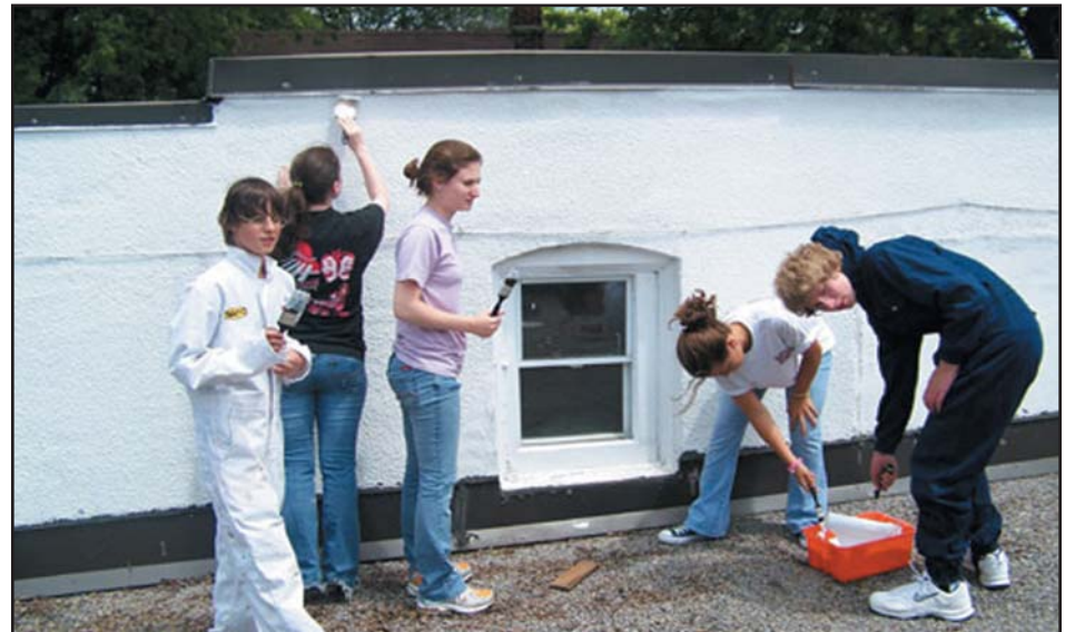
Juniors are shown painting the exterior of St. John the Compassionate Mission.

For more information on St. John the Compassionate Mission, visit our Diocesan website: www.acrod.org